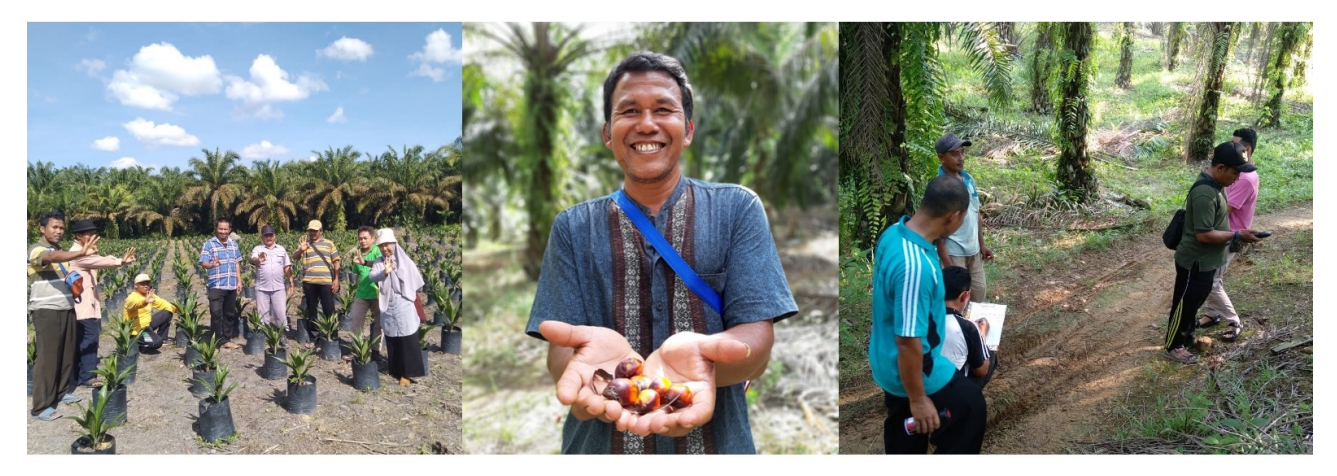
The B#-SDG Scorecard enabled independent farmers to self-report and evidence sustainable practices in edible oil production and get paid for it.

CitizenMe mobile survey was available in Bahasa Indonesia and other target languages.